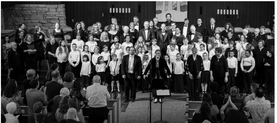
Dubuque Chorale combined choirs, spring 2024